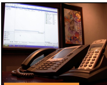
VoIP Phone Systems

Visit our website at www.AlternateAccess.com to learn more about our product offerings.